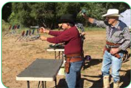
Big Horn Bari mastering the gunfighter style.

Please contact Double Diamond at 760-745-9249 or dbrinkmeier1@cox.net for information concerning Cowboy Action Shooting.