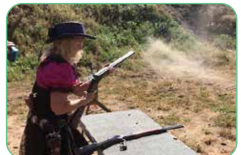
Lantana Lady ejecting 2 empty shells with ease.